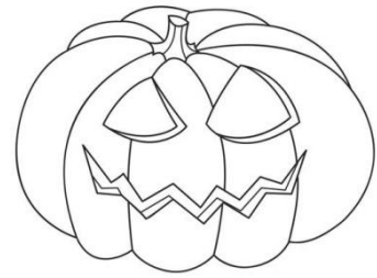
JACK O' LANTERN